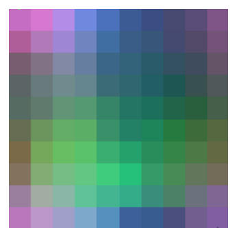
Figure 4. SOM visualizing the soundscape database, using standard deviation of brightness, loudness, and noise, after three epochs. Since the database has fewer items, the matrix was reduced to 10 x 10.

Figure 5 displays the selected GarageBand loop database, using mean brightness, standard deviation of brightness, and mean frequency. In this case, those squares that are dark contain low frequencies, and have little change in their spectral centroid (i.e. the bass samples); those squares that are yellow have higher spectral energy, with dynamic spectral change (i.e. the percussion samples).