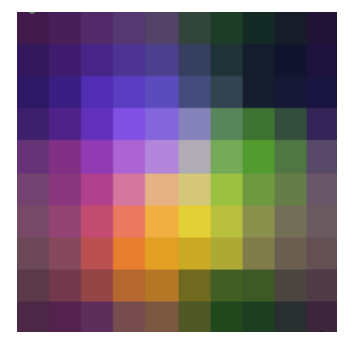
Figure 5. SOM visualizing the GarageBand loop database, using mean and standard deviation for brightness, and mean frequency.

Figure 5 displays the selected GarageBand loop database, using mean brightness, standard deviation of brightness, and mean frequency. In this case, those squares that are dark contain low frequencies, and have little change in their spectral centroid (i.e. the bass samples); those squares that are yellow have higher spectral energy, with dynamic spectral change (i.e. the percussion samples).