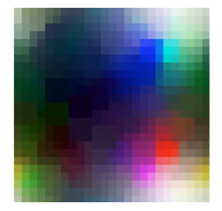
Figure 1. An example visualization of the SOM of the percussion sample library.

Self-organisation initially takes place on the global scale (since the initial neighborhood is the entire map), whereas over time, the neighborhood shrinks to what is eventually a single node, and the weights converge to local estimates.